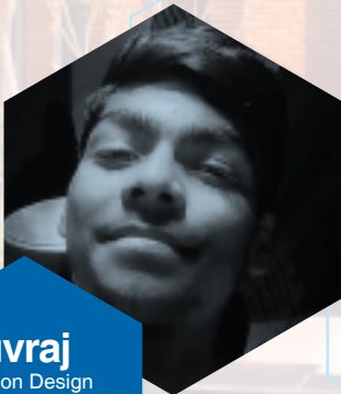
Yuvraj Fashion Design Aspirant | Pg 10

Five former VidyaGyan students, aspiring to change the world around them.