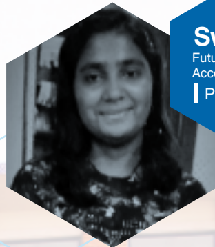
Swati Future Chartered Accountant | Pg 4